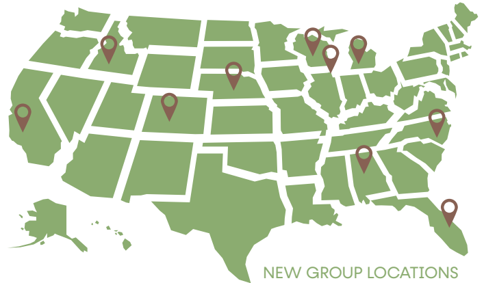
NEW GROUP LOCATIONS